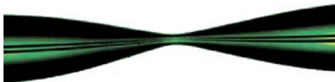
JIFFY TUBE Hourglass-shaped capillary made it possible for Shear and coworkers to achieve microsecond electrophoretic separations.

cell lysis, electrophoretic separation, and fluorescence detection was developed by J. Michael Ramsey and coworkers at Oak Ridge National Laboratory [ Anal. Chem., 75, 5646 (2003) ]. The apparatus makes it possible to analyze single cells at rates of seven to 12 cells per minute--more than 100 times faster than the standard CE approach. Potential applications include clinical diagnosis and fundamental studies on cell-to-cell heterogeneity.